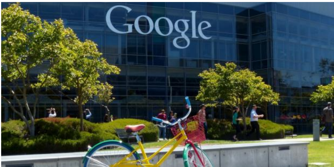
Google Roman Boed/Flickr